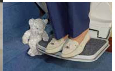
The footrest is covered with non-slip material and fitted with safety edges.