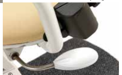
The lever for the rotation of the seat is comfortable and fast

The joystick placed on the armrest ensures the control of the course in a functional, simple and direct way; the folding seat opens and closes easily, and the radio controls allow to manage the stairlift calling it to the desired floor.