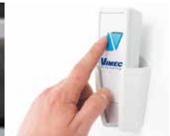
Remote control panel